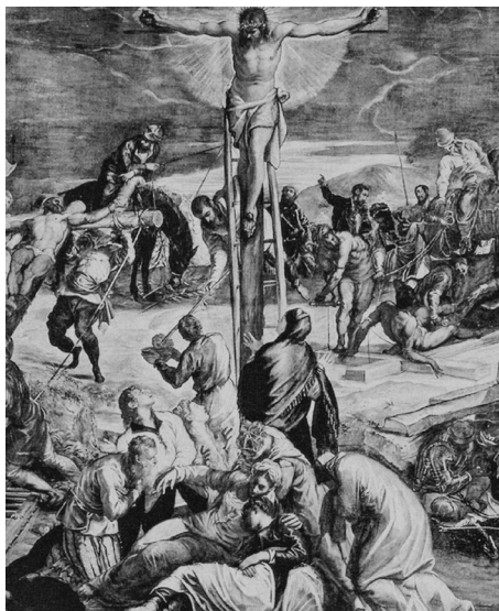
Good Friday Mark 15

Don’t miss Mark in March #2 on Good Friday at 5:00 or 7:00 PM!